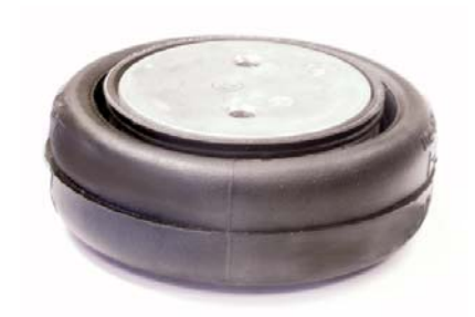
HEAVY DUTY AIR BAG