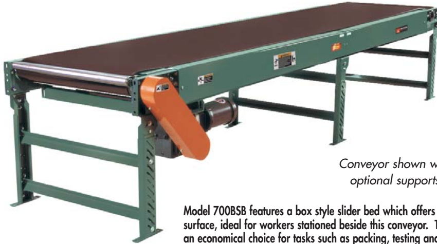
Conveyor shown with optional supports

24 HOUR SHIPMENTS INCLUDE ALL 1-FOOT INCREMENTS 5'-0" TO 100'-0"