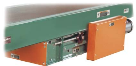
OPTIONAL CENTER DRIVE